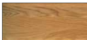
Oak, natural oil

Design: Mother nature Origin: Oak, Europe Origin: Beech, Europe Composition: Seat in Veneer, Legs and back in solid wood