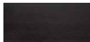
Beech, black lacquered