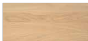
Oak, white oil